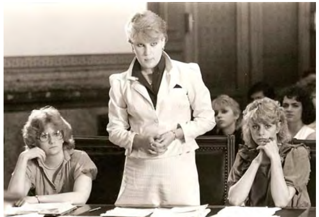
Students from Cloquet High School (Minnesota) compete in the first national tournament.

After the success of the tournament in Iowa, more states became interested in participating and the tournament became billed as an "All-State" Tournament. The competition then moved to Lincoln, Nebraska (1985) and involved 10 states. Subsequent tournaments have been held in Phoenix, Arizona (1986); Washington, D.C. (1987); Dallas, Texas (1988); Louisville, Kentucky (1989) - the first "National High School Mock Trial Championship"; Portland, Oregon (1990); New Orleans, Louisiana (1991); Madison, Wisconsin (1992); Atlanta, Georgia (1993); Chicago, Illinois (1994); Denver, Colorado (1995); Pittsburgh, Pennsylvania (1996); Nashville, Tennessee (1997); Albuquerque, New Mexico (1998); St. Louis, Missouri (1999); Columbia, South Carolina (2000); Omaha, Nebraska (2001); St. Paul, Minnesota (2002); New Orleans, Louisiana (2003); Orlando, Florida (2004); Charlotte, North Carolina (2005); Oklahoma City, Oklahoma (2006); Dallas, Texas (2007); and soon to be Wilmington, Delaware (2008).