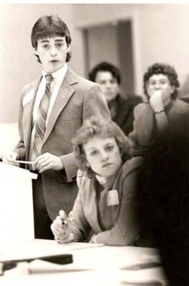
Students from Elkader, Iowa participate in a round during the first national tournament.