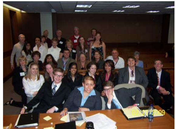
The 2009 mock trial team from Bishop Gorman High School in Las Vegas, NV