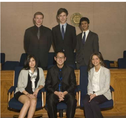
Rock Canyon HS Mock Trial Team (Colorado)