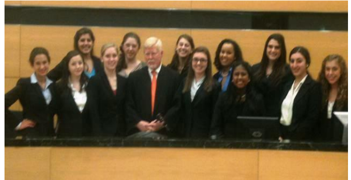
La Reina HS Mock Trial Team (California)